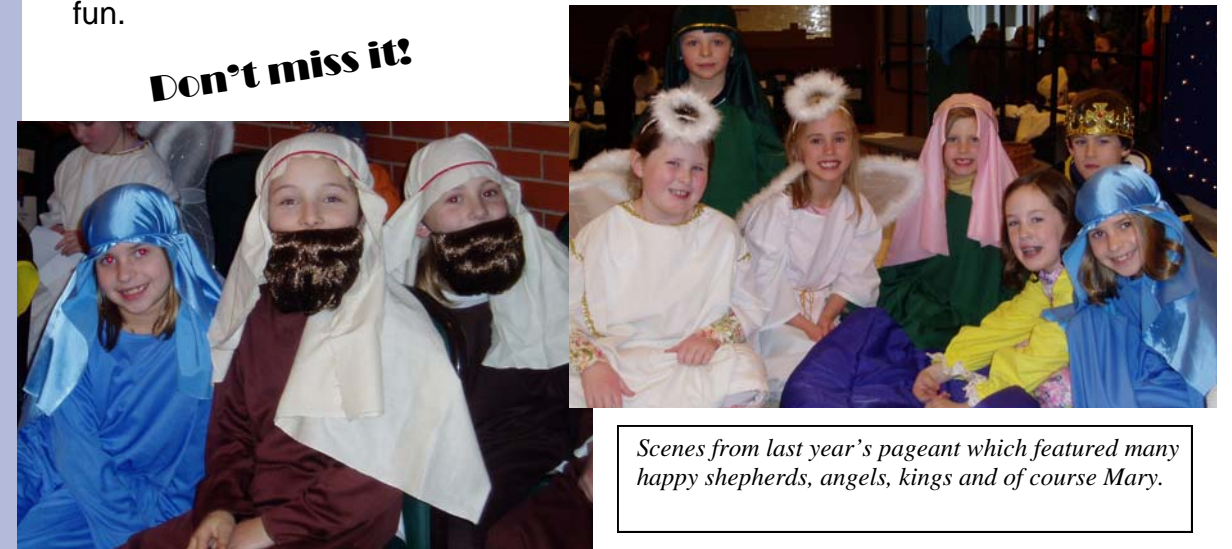
Scenes from last year's pageant which featured many happy shepherds, angels, kings and of course Mary.